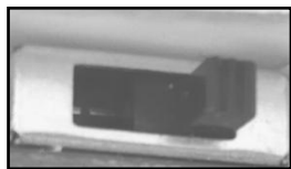
Left=Slowest / Right=Fastest

Your board has 2 adjustable speed ranges: High & Low . A slide switch located in the battery compartment of remote control gun controls the speed range. To adjust the speed capacity, turn off the wireless remote and remove the battery cover from the base of remote control handle. Locate the slide switch inside the compartment. Set the switch to the desired speed range: left = slowest; right=fastest speed range. (See picture below, left.) With slide switch set, you can turn on the board, then the remote.